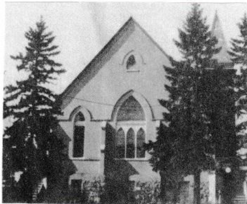
Knox Presbyterian Church