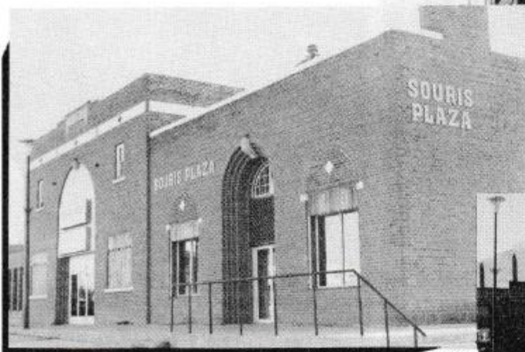
Present tenants at the time of printing Plaza Petals, Bev Somersall Plaza Deli, Isabel Winters